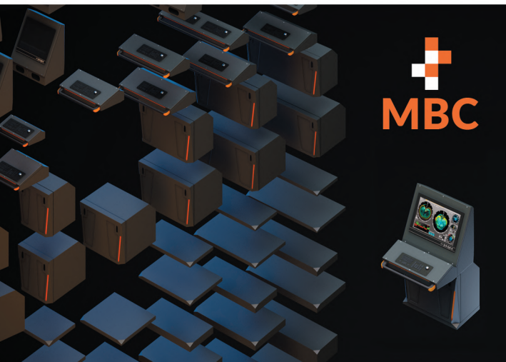
Catalogue 3D Modular Bridge Consoles