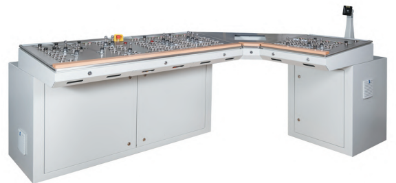
Examples of electrical cabinets and switchgears designed and manufactured in our company.