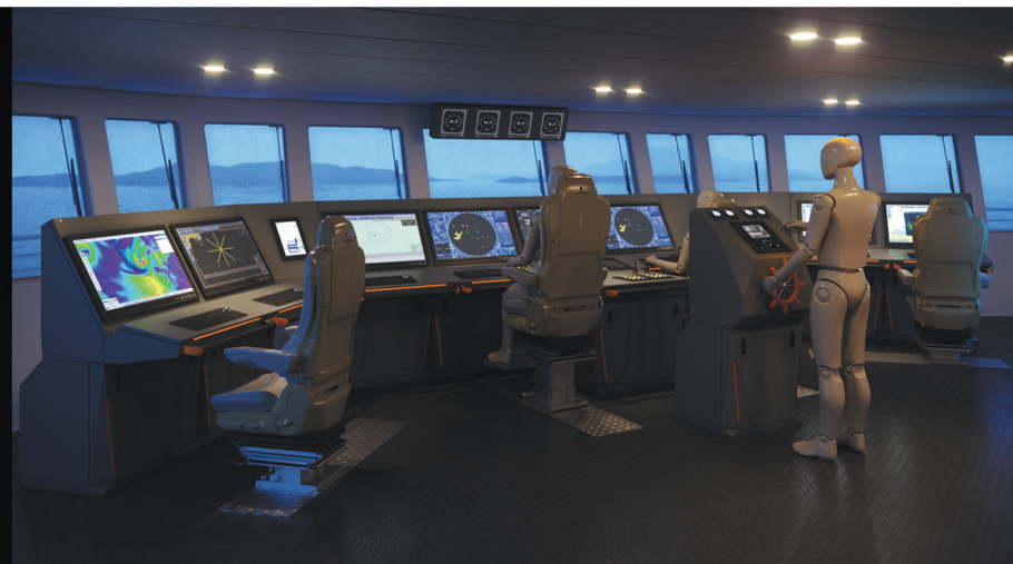
Installation of wheelhouse with MEC console modules